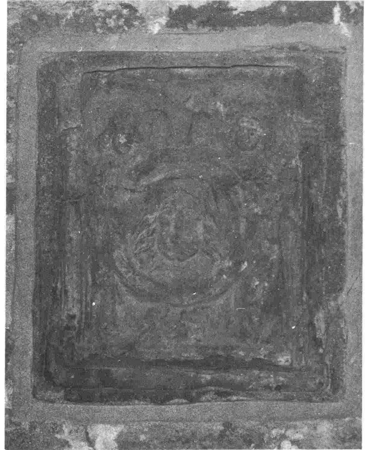
Battisford: an early Tudor terracotta plaque bearing the head of St John the Baptist, flanked by two angels. Formerly built into the base of the chimney stack, now above a fireplace in St John's Manor.