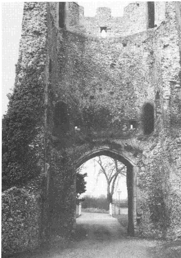
Mettingham Castle: the gatehouse, c. 1342. Interior, showing the use of brick for the door surrounds at first floor level.