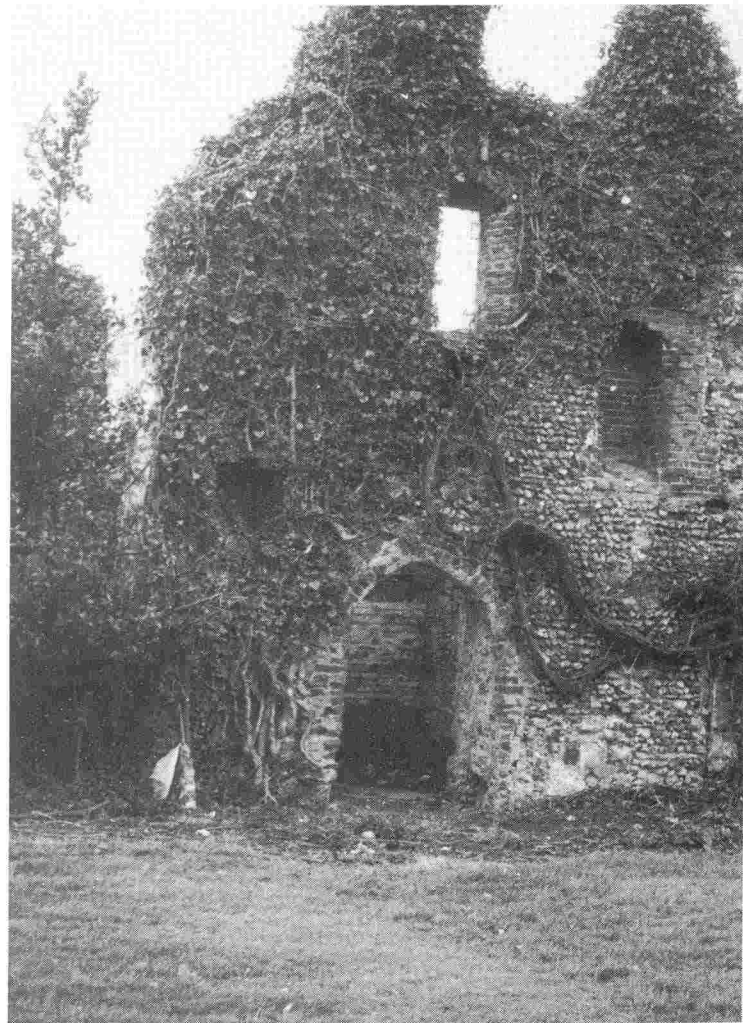
Mettingham Castle: east elevation of the small ruined building. The doorway and window are probably original, but on either side are later openings for chimney flues.