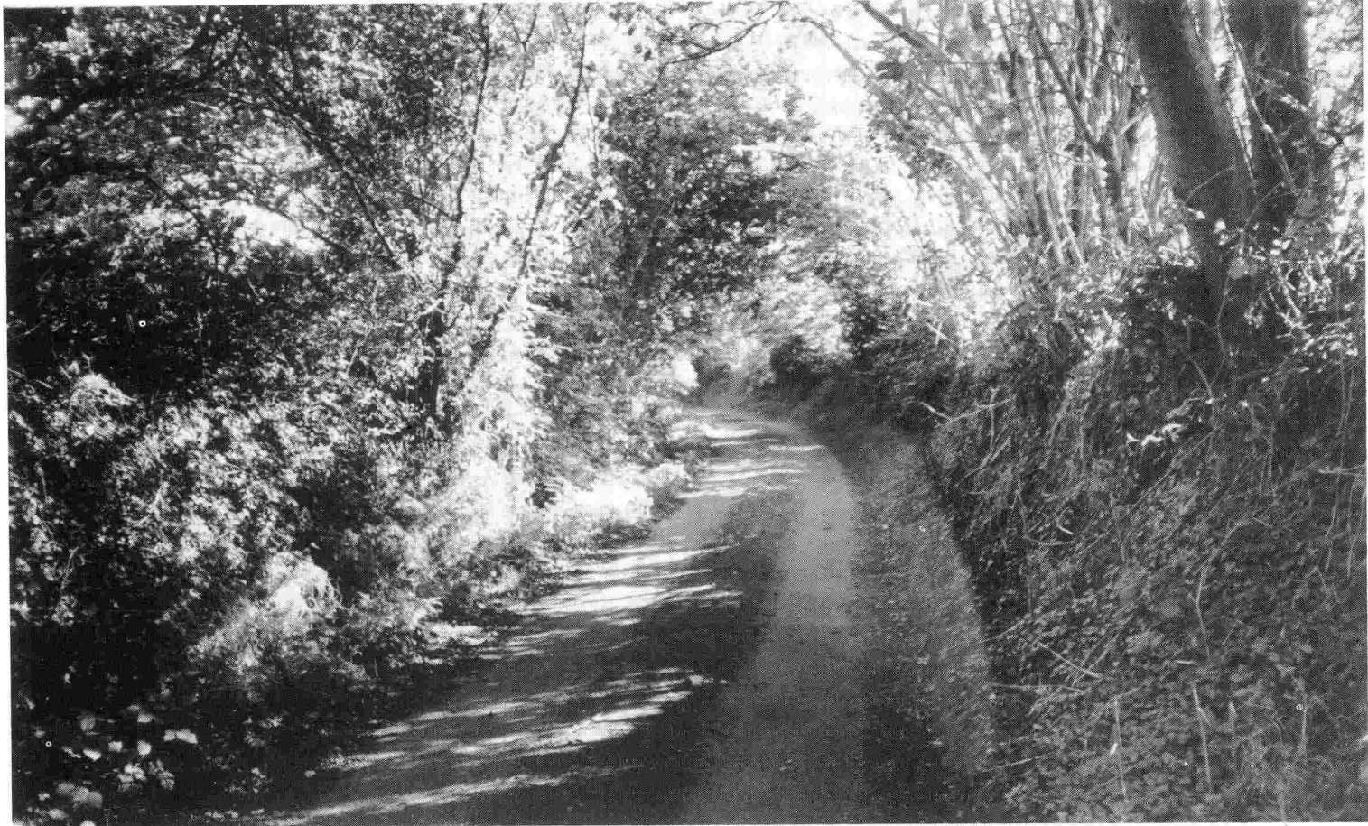
Bramford: Grindle Lane, marking the Anglo-Saxon boundary between Bosmere and Samford Hundreds, as well as the parish boundary between Bramford and Sproughton.